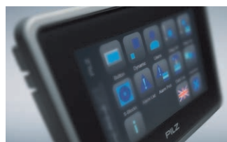
Operation and monitoring